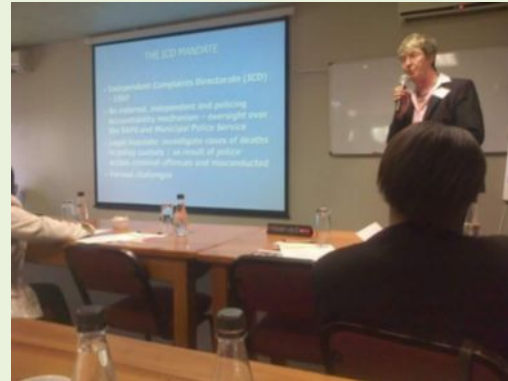
Picture 1 & 2: Ethics Training held in Centurion – EthicsSA Headquarters